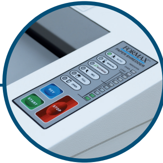
Easy-to-Use Control Panel Auto, Reverse, Bin Full Indicator, Load Indicator, ECO Mode