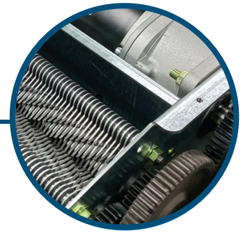
Commercial Grade Heat-treated solid steel cutting blades, all metal gears, AC geared motor