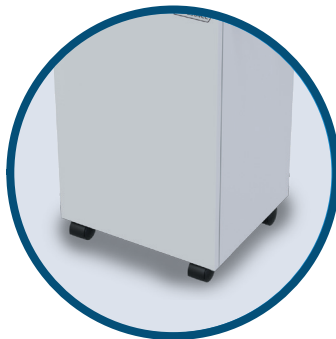
Rugged All-Metal Cabinet Includes casters for mobility