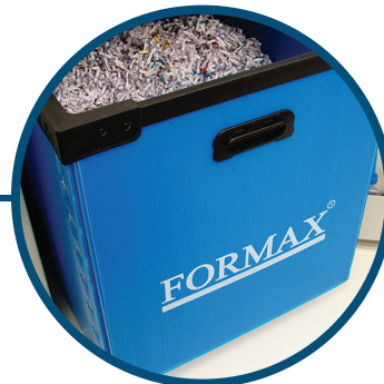
Durable Waste Bin Lifetime guaranteed rugged molded plastic for durability